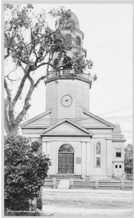
First Universalist Church, Canton Massachusetts