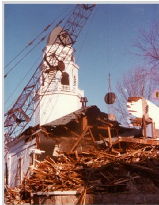
Demolition of Universalist Church, Canton Massachusetts