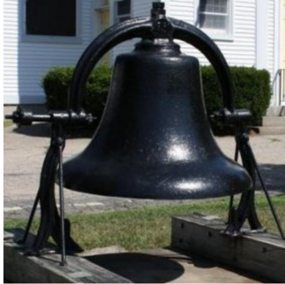
Bell from the Steeple of the Universalist Church, Canton Massachusetts